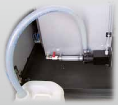
Built-in tank draining pump for used cooling medium. To be disposed of as cooling emulsion.