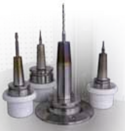
Basic gripper SK50, HSK100 Quick-change adapter sockets for SK40 and HSK63 belong to the standard equipment.