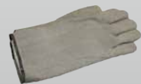
Protection gloves Art.-No.: 990-398