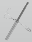
Universal shrinking aid Art.-No.: 990-399