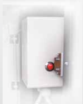
Button for tank draining