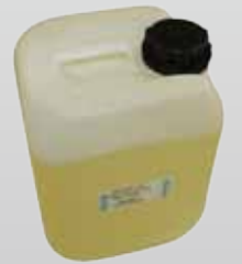
Concentrated cleaner Art.-No.: 990-397